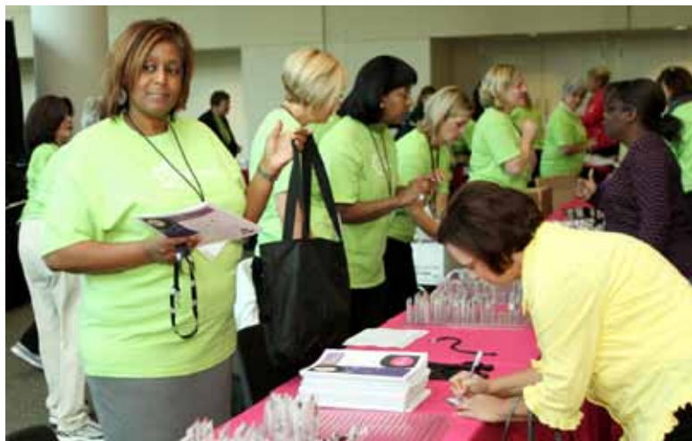
Volunteers get the Speaking of Women’s Health attendees registered and outfitted with their gift bags.

Just for your information – WFYI is the host and driving force behind this community event; but we couldn’t do it without the support of our local presenters and sponsors. Those local businesses that sponsored “Speaking of Women’s Health” this year are: St. Vincent Women’s Services, Anthem Blue Cross and Blue Shield, Fifth Third Bank, Barrington Jewels, Bright Ideas in Broadripple, Flanner & Buchanan Funeral Centers, Printing Partners, Hilton Garden Inn, Honors Beauty College, Impact Group, JP Parker Flowers, Kinetico, Kipp Brothers and The Health Foundation of Greater Indianapolis.