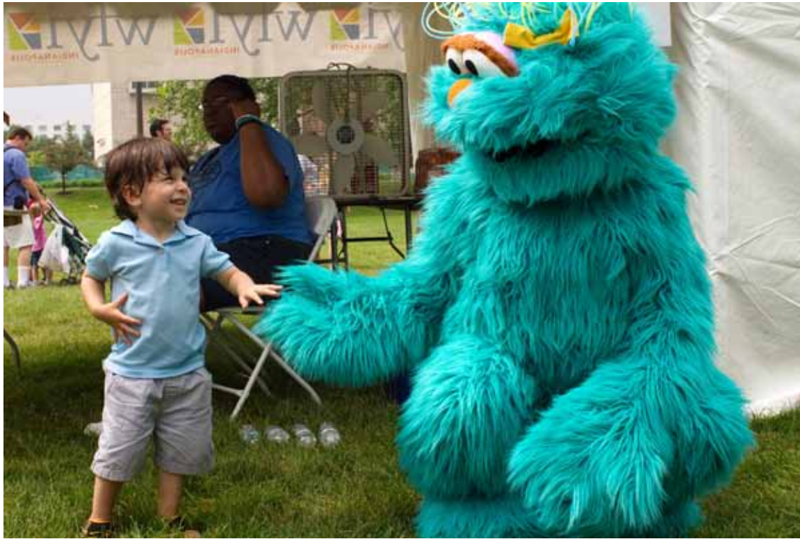
A Sesame Street fan meets walkaround Rosita during Let's Meet PBS KIDS in the Park.