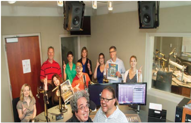
WFYI's Public Radio staff celebrates being named Best Radio Station of Indianapolis

1,400 volunteers, whose 16,000 hours of donated time last year was worth $359,317.00, are truly the critical backbone of support that make the services of WFYI possible.